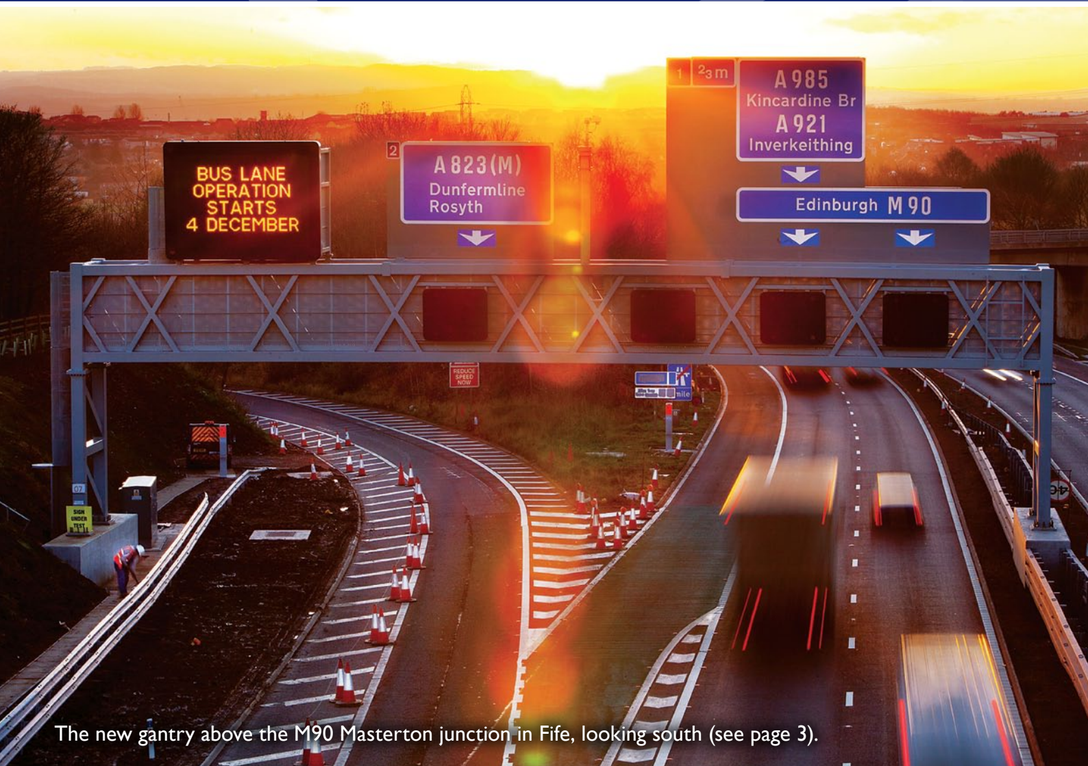
The new gantry above the M90 Masterton junction in Fife, looking south (see page 3).