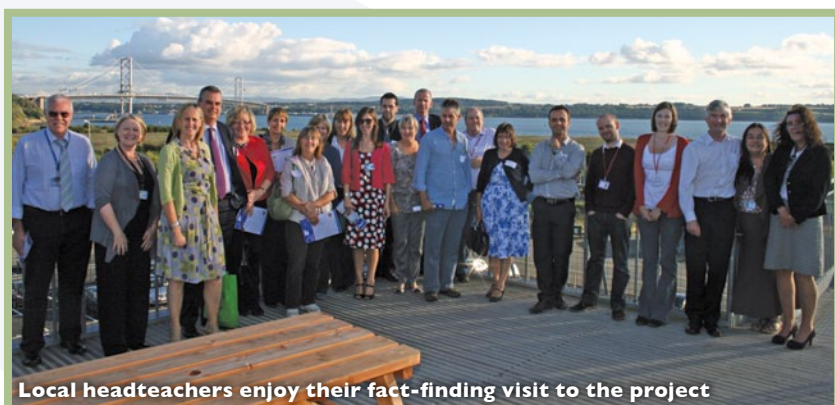
Local headteachers enjoy their fact-finding visit to the project