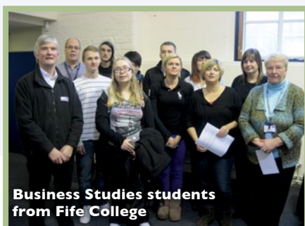
Business Studies students from Fife College