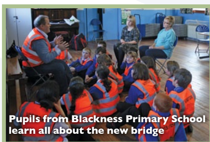
Pupils from Blackness Primary School learn all about the new bridge