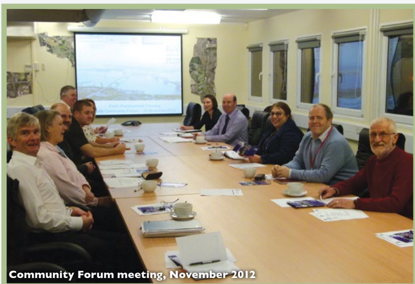
Community Forum meeting, November 2012