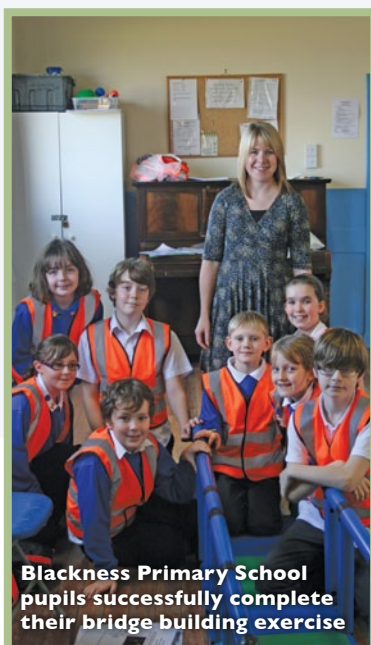
Blackness Primary School pupils successfully complete their bridge building exercise