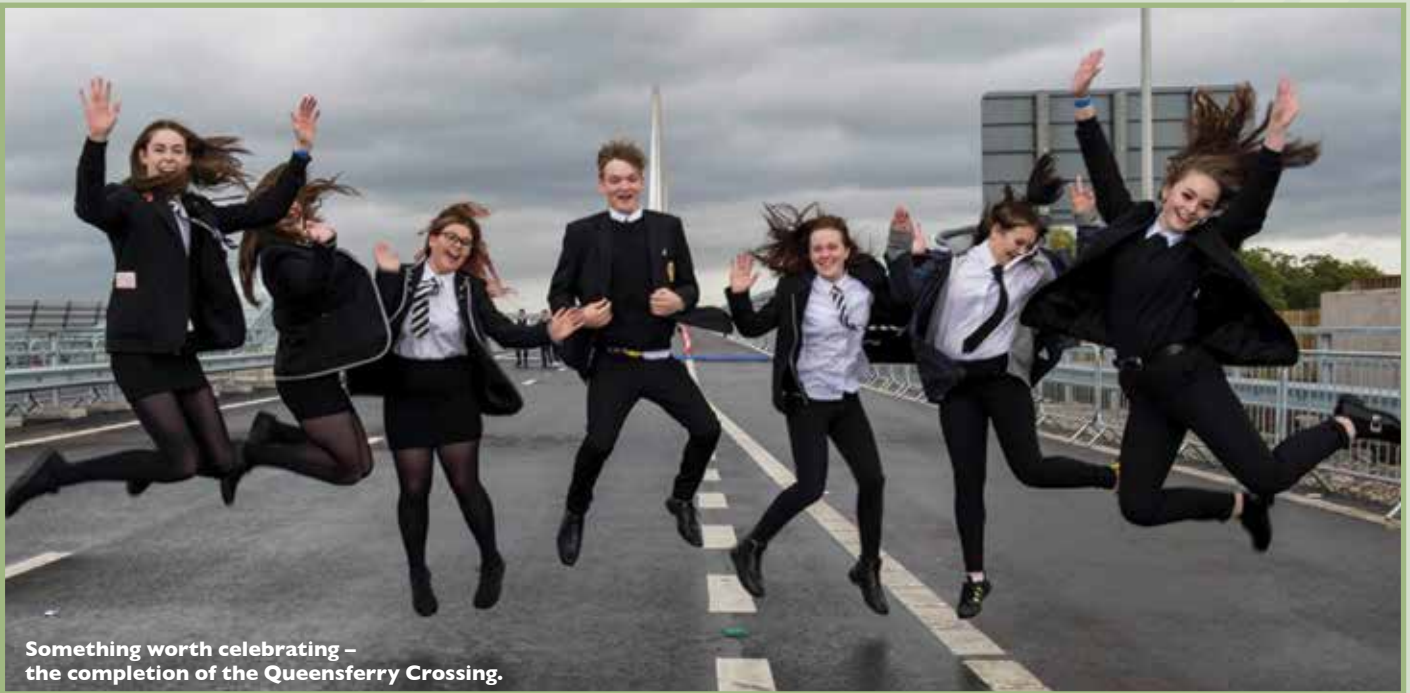
Something worth celebrating – the completion of the Queensferry Crossing.