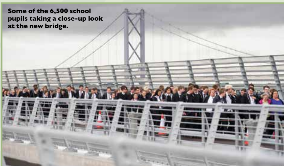
Some of the 6,500 school pupils taking a close-up look at the new bridge.

What a fantastic and appropriate way to bring to a close all the celebrations marking the completion of Scotland's latest, magnificent bridge!